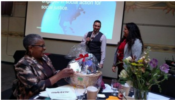
And we had gorgeous weather!